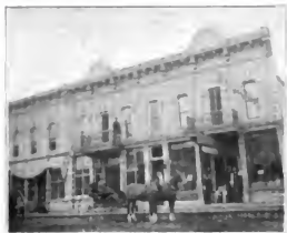
AN EARLY-DAY STREET SCENE IN FOREST CITY

Building opposite team and buggy, occupied by First National Bank, 1876-1883.